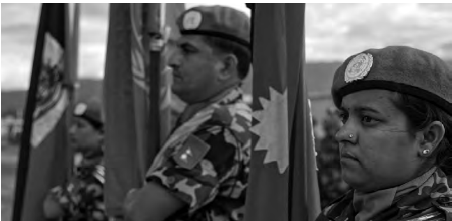
▲ Nepalese peacekeepers on parade. Port-au-Prince, Haiti. March 2009.

Operational advice to Member States should also stress the importance of nominating a dedicated gender focal point within every military contingent, with clear terms of reference. The military gender focal point would provide ongoing advice to contingent commanders on how a gender perspective can enhance the efficiency and effectiveness of the contingent's operational tasks, and would offer targeted in-mission gender training to members of the contingent. The gender focal points would serve as principal points of liaison between the contingent and the peacekeeping mission's Office of the Gender Adviser.