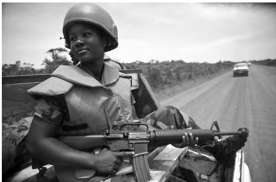
▲ Ghanaian peacekeeper on patrol in Buchanan, Liberia. April 2009.

women may observe firsthand the movements and actions that may affect the security environment. This information could enhance peacekeepers' understanding of the security environment and improve their interventions.