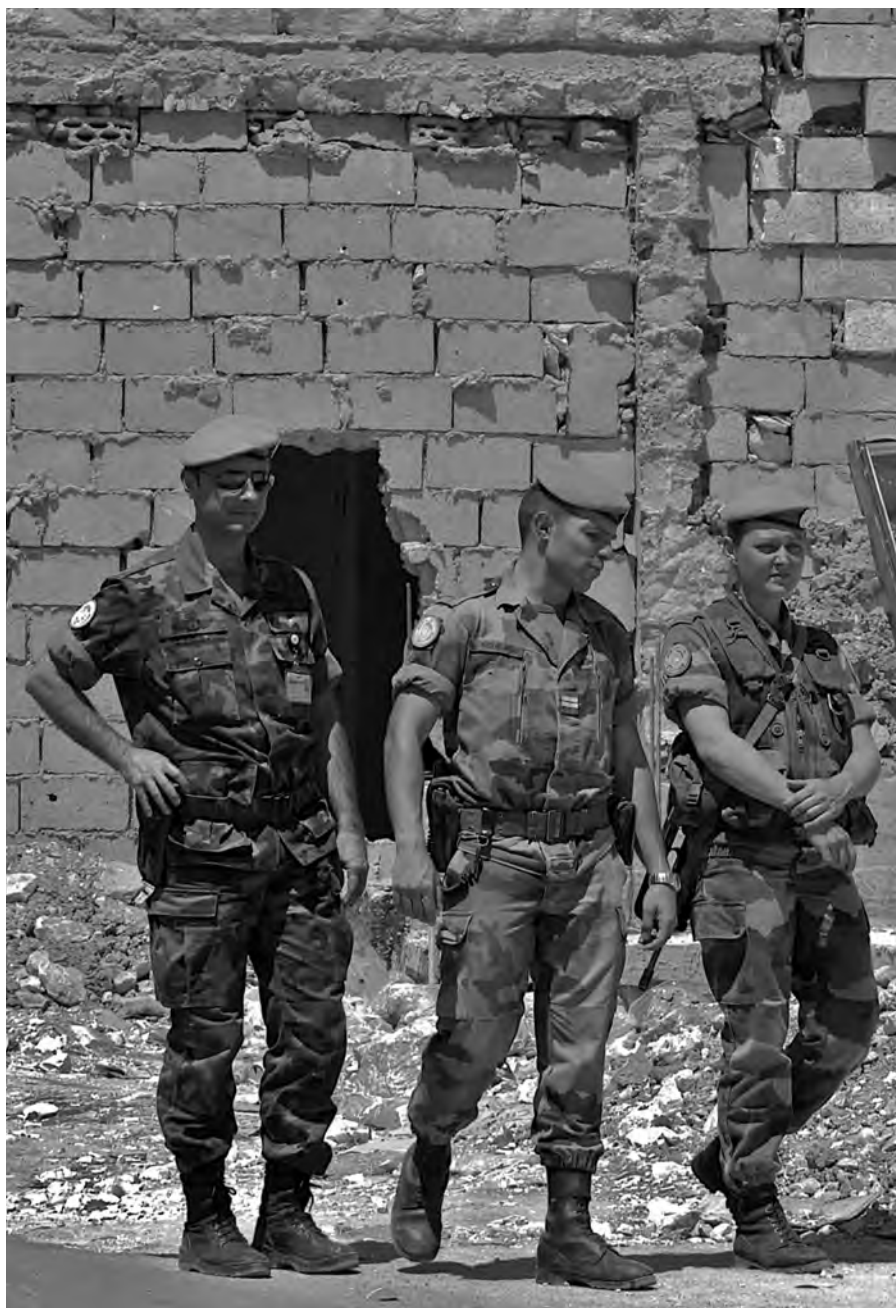
▲ UNIFIL peacekeepers on patrol in Bint Jbeil, Lebanon. June 2007.