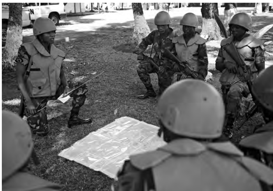
▲ Ghanaian peacekeepers in Buchanan, Liberia. April 2009.

Military planners should further ensure close working relations with gender specialists in the peacekeeping mission to strengthen information-sharing. Gender specialists can also facilitate the inclusion of local women's perspectives in information analysis and assessments, which will, in turn, inform the force commander's planning and the execution of mandated tasks.