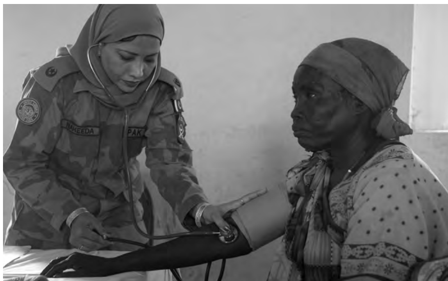
▲ Member of a Pakistani medical team treats local patient in Ed-Damazin, Sudan. November 2008.

Military operations to protect humanitarian and UN personnel and assets should ensure that humanitarian organizations working to support victims of sexual violence enjoy safe access when delivering assistance and attending to victims of sexual violence.