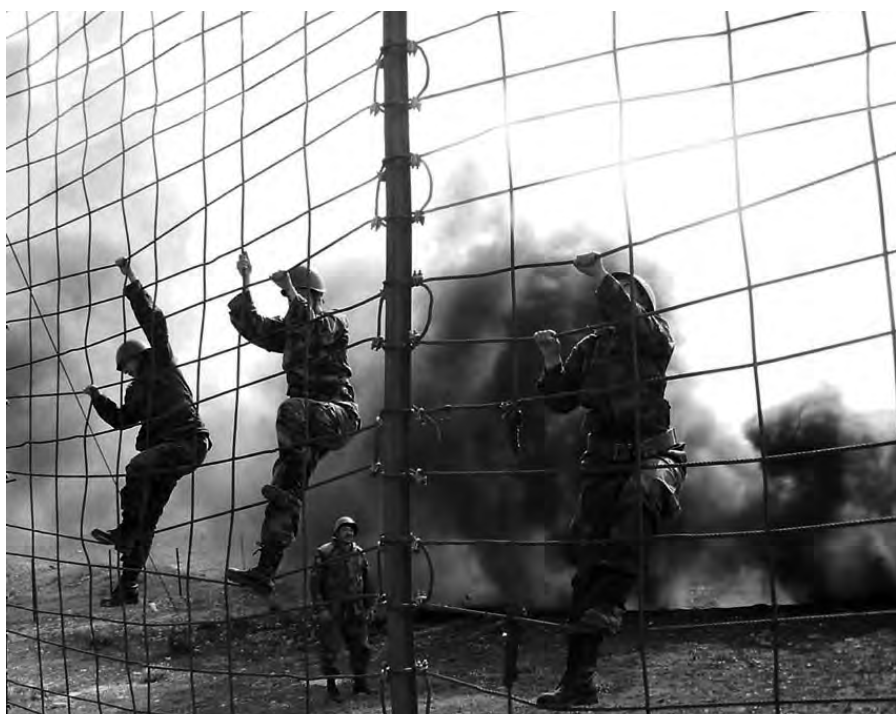
▲ Female military officers climb a rope ladder during training, 2009.

rights, including the role of national security forces in preventing violations of women's rights. Training support should include guidance to assist national security forces in preventing and protecting women and girls from sexual violence, underscore a zero-tolerance approach to the commission of such crimes by national security forces, and stress the role played by the national armed forces as the protectors of the civilian population. Advice should also emphasize equal access to and participation by male and female personnel of national armed forces in training activities.